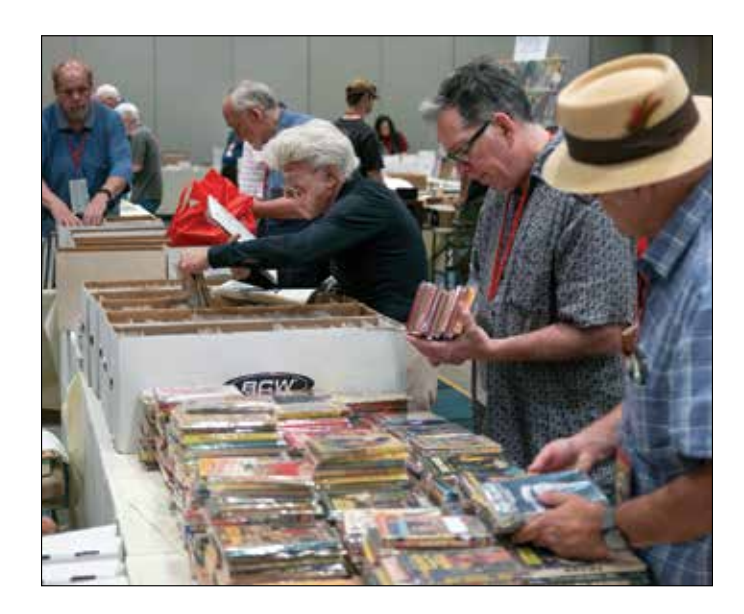
Pulp collectors in the PulpFest 2019 dealers' room

We are looking for dealers or organizations that would like to help sponsor our hospitality suite. Please contact Mike Chomko at mike@pulpfest.com to help or learn more.